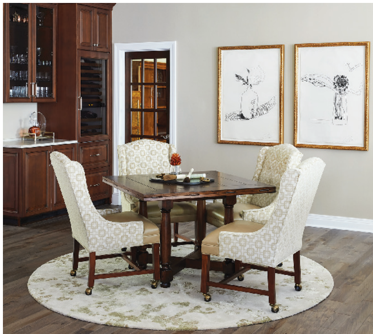
This great room game table doubles as extra dining space.