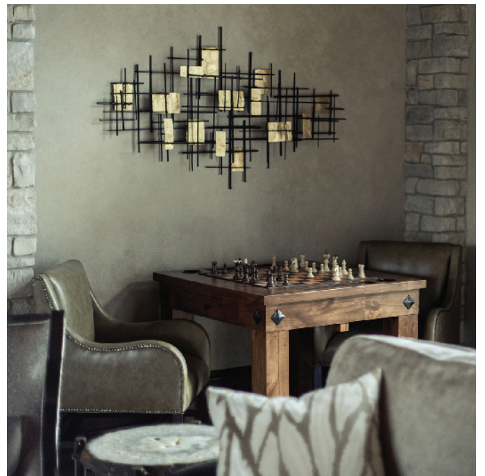
Chess, anyone? We placed five games tables throughout this family's home.